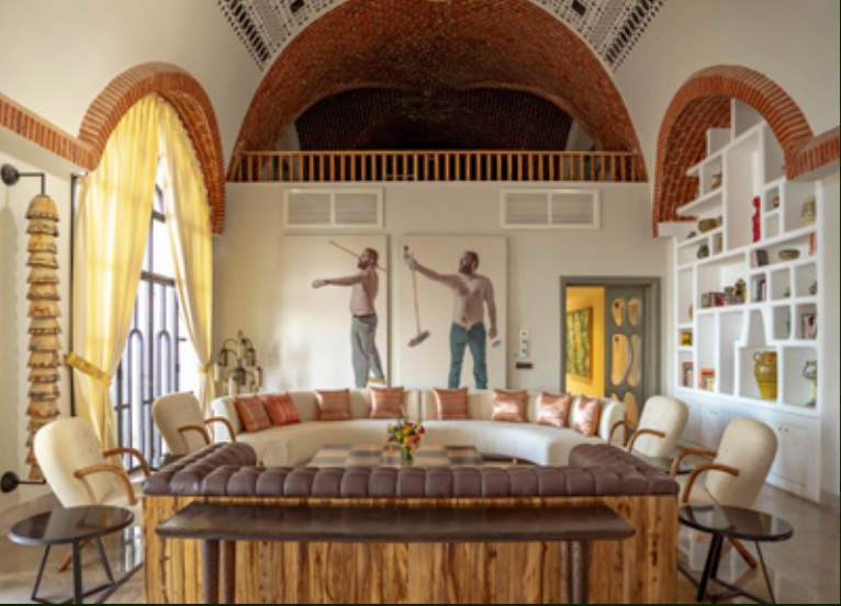
Main Living Room